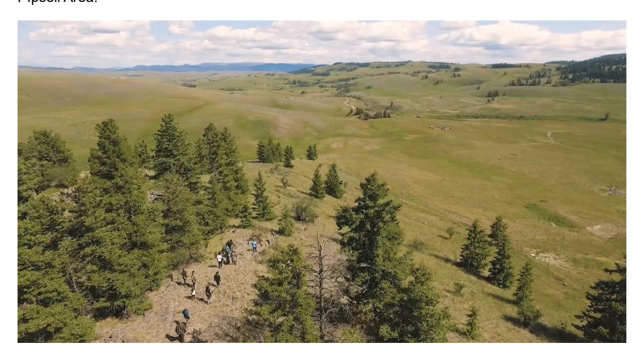
Screengrab of the Pípsell (Jacko Lake) area in Secwepemcúl'ecw from Stk'emlúpsemc te Secwépemc Nation's (SSN) 2017 video, "Pipsell – a Secwepemc Nation Cultural Heritage Site."