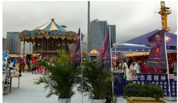
The city of Qingdao.