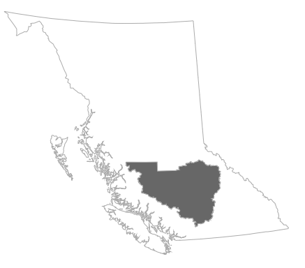
The Thompson Rivers College Region, British Columbia

Thompson Rivers University (TRU) creates a significant positive impact on the business community and generates a return on investment to its major stakeholder groups—students, taxpayers, and society. Using a two-pronged approach that involves an economic impact analysis and an investment analysis, this study calculates the benefits received by each of these groups. Results of the analysis reflect fiscal year (FY) 2023-24.